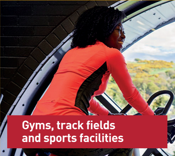
Gyms, track fields and sports facilities