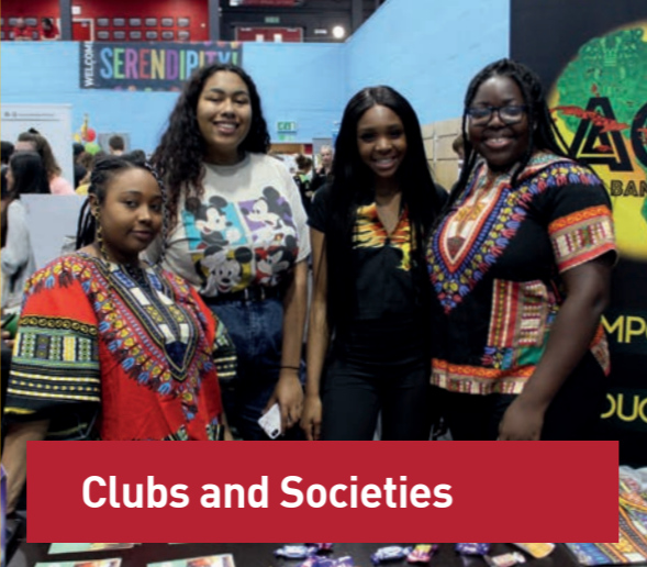
Clubs and Societies