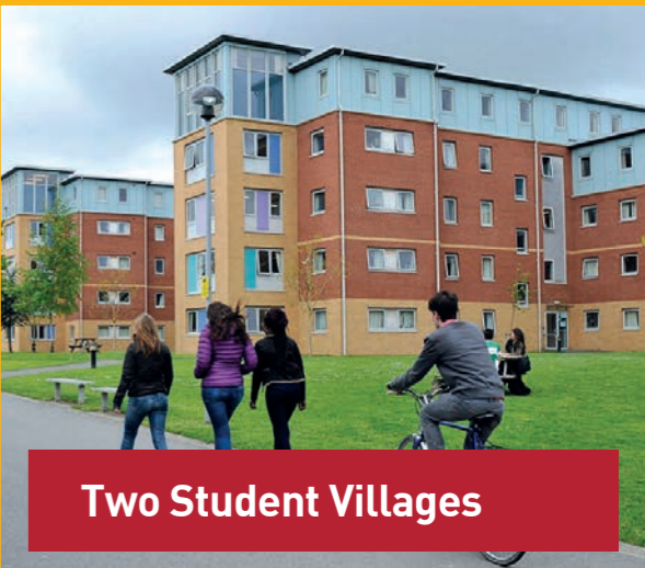
Two Student Villages