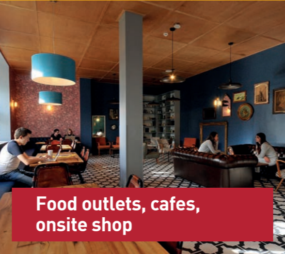
Food outlets, cafes, onsite shop