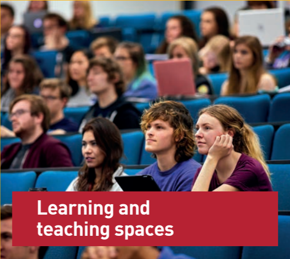
Learning and teaching spaces