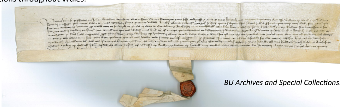
BU Archives and Special Collections: Penrhyn 10.

To find out more about ISWE, visit http://iswe.bangor.ac.uk