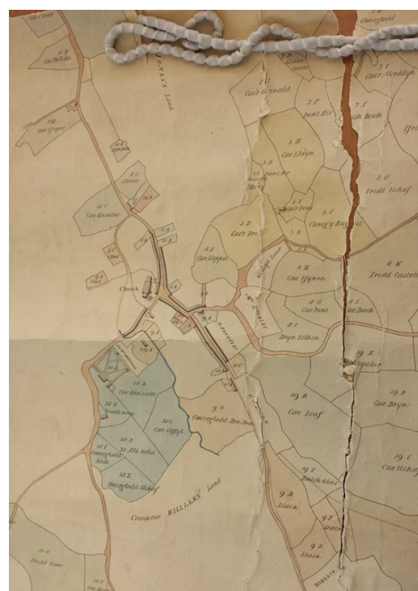
BU Archives and Special Collections: Penrhyn 2202 - Plan of Penrhyn lands in the parish of Bangor, c.1760.

The aim of the project is to undertake essential conservation work on a number of maps within the collection. Due to the fragile state of the maps, the Archives have not been able to allow access to these valuable documents for some time. The funding will contribute towards the Archives’ mission of making the records in their custodianship as well cared for and widely accessible as possible.