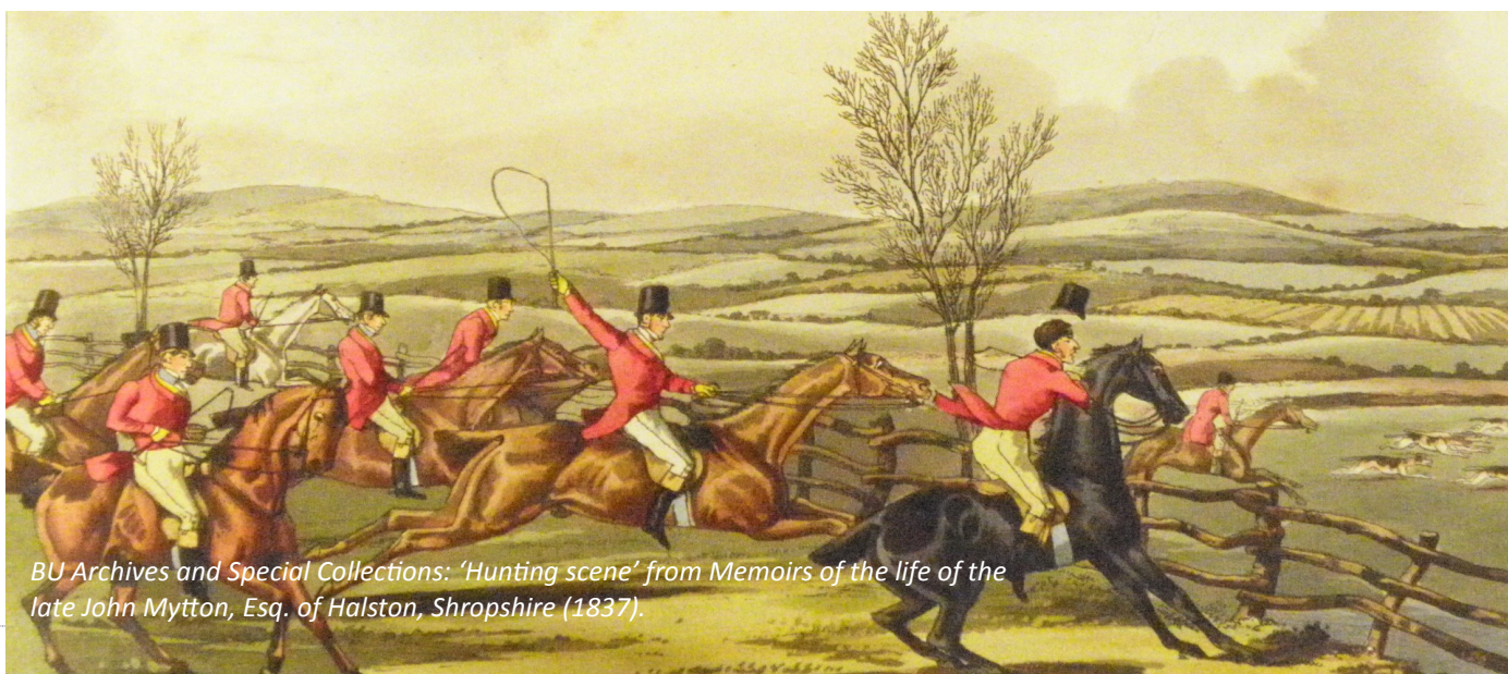
‘Hunting scene’ from Memoirs of the life of the late John Mytton, Esq. of Halston, Shropshire (1837).