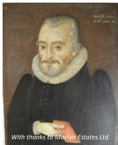
With thanks to Mostyn Estates Ltd.