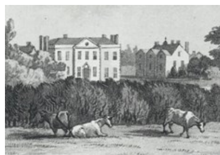
'Ynysmaengwyn' from J. Baker, A Picturesque Guide Through Wales (1795).

the powerbases at the centre of the nation's landed estates. Many of these buildings are still in the possession of their long-standing ancestral residents; others are cared for by organisations such as the National Trust; far too many have been demolished or are in serious risk of decay and obliteration.